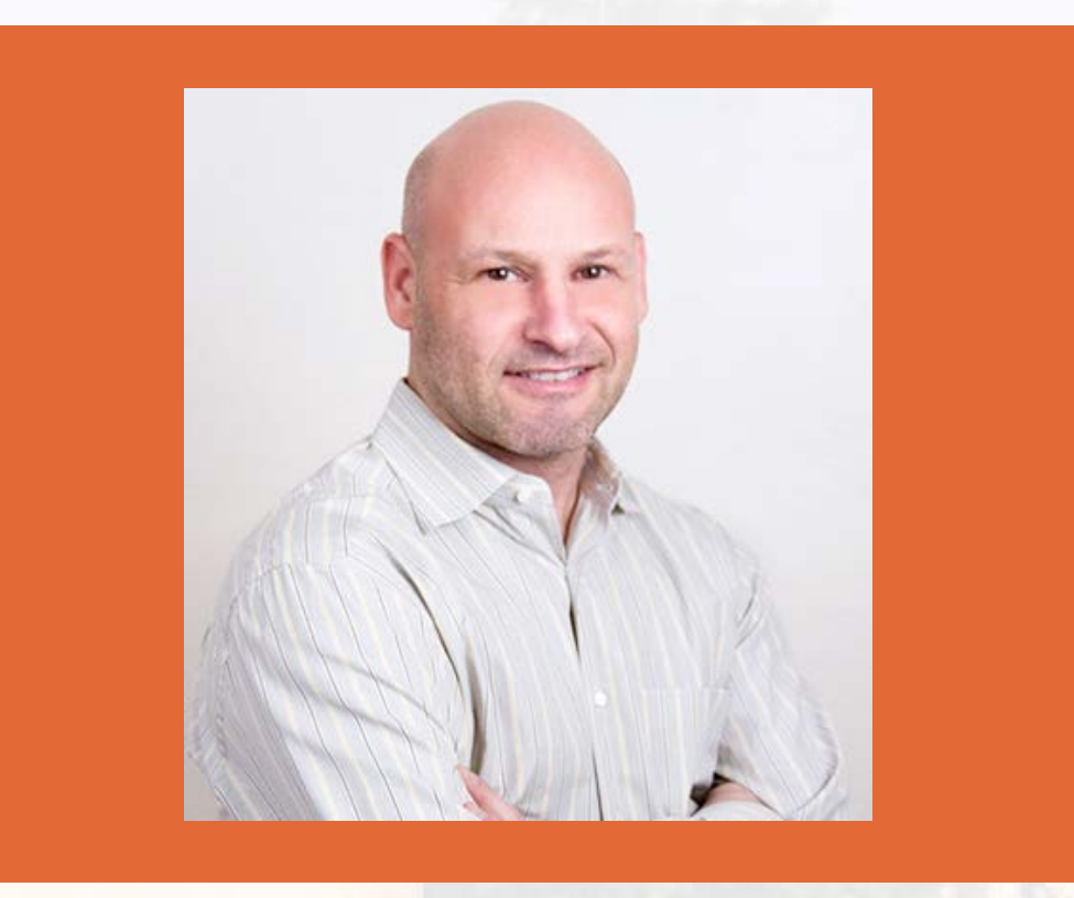
Read more : https://www.wfc2019.net/the-future-of-csds-according-to-joe-lubin/