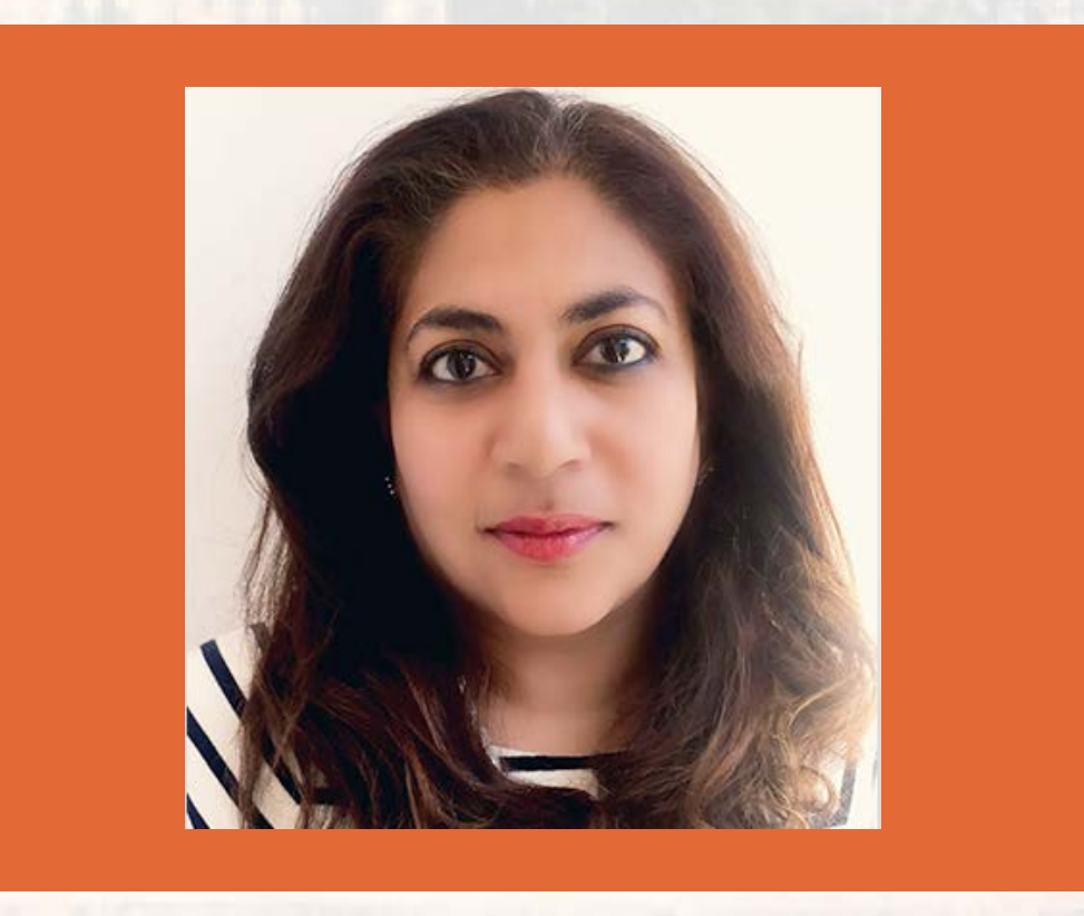
Read more : https://www.wfc2019.net/csds-will-thriveif-they-stay-close-to-their-customers-says-sukumar/